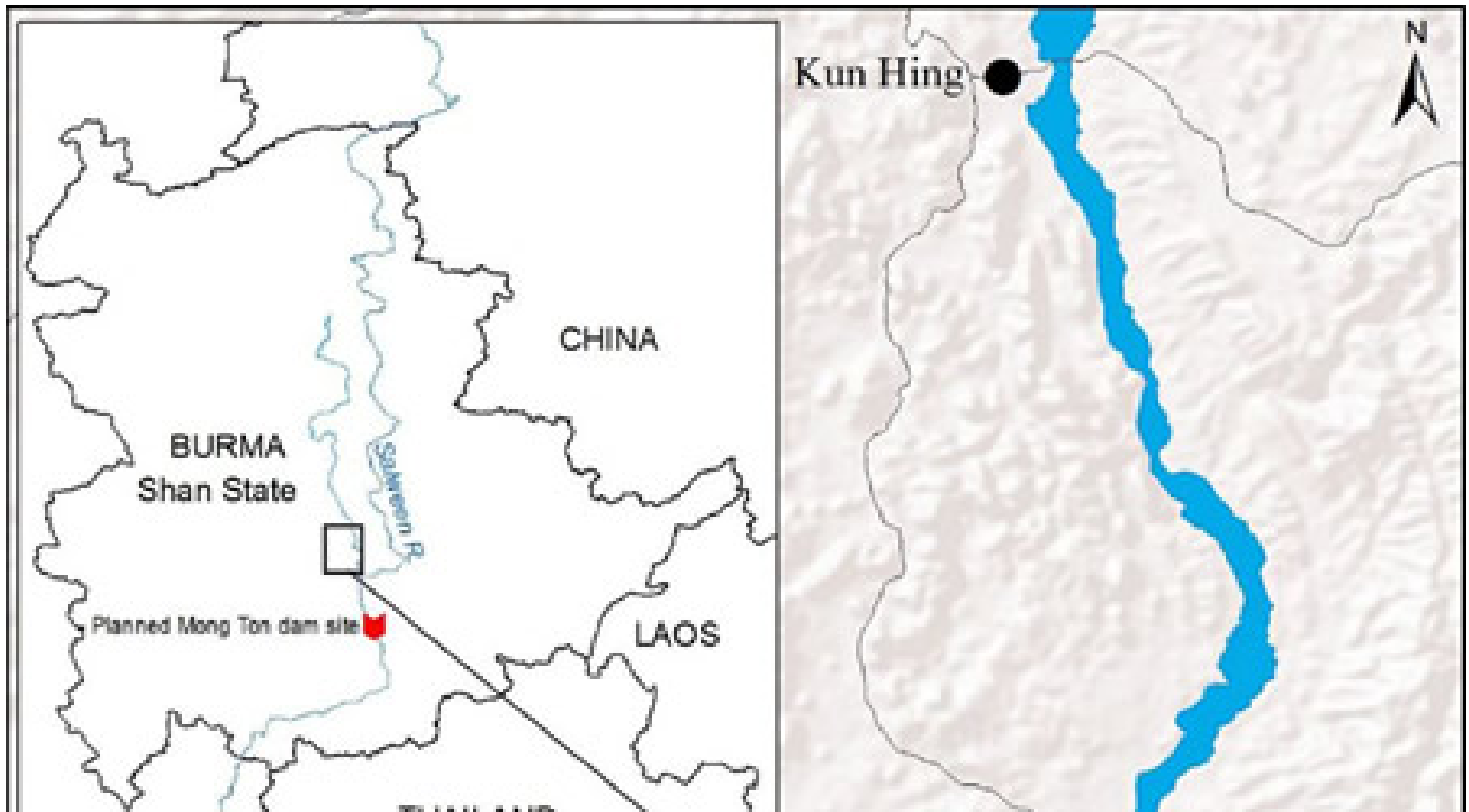
Conflict and Abuse in Southern Shan State

(/news/refugees-watch-election-with-interest,-trepidation/)